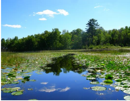
Protecting waters, woods, and wildlife for future generations.